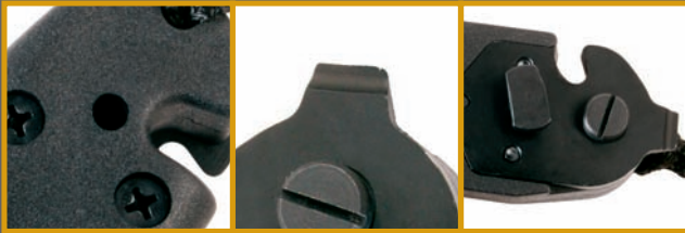
Water drainage hole