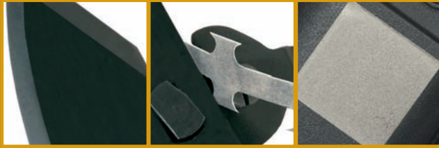
Strong 3,6 Bowie blade