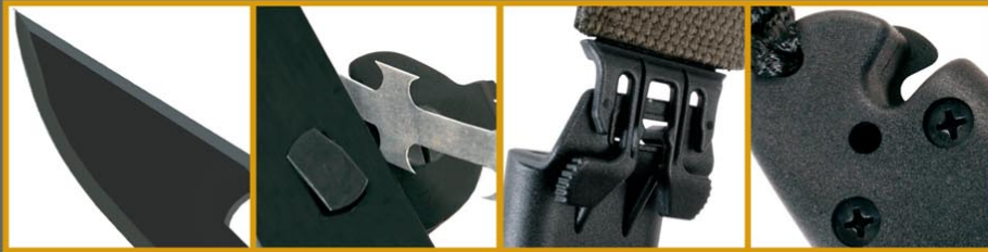
Strong 3,6 mm Bowie blade